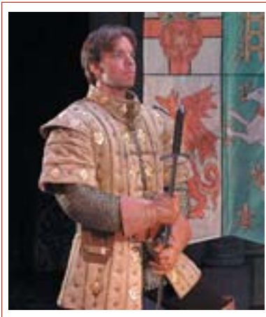
Production photos from the Utah Shakespearean Festival